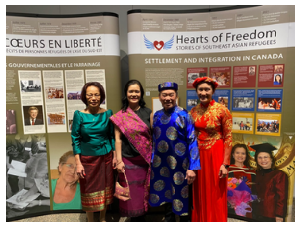
Laotian and Vietnamese attendees at Manitoba Museum.