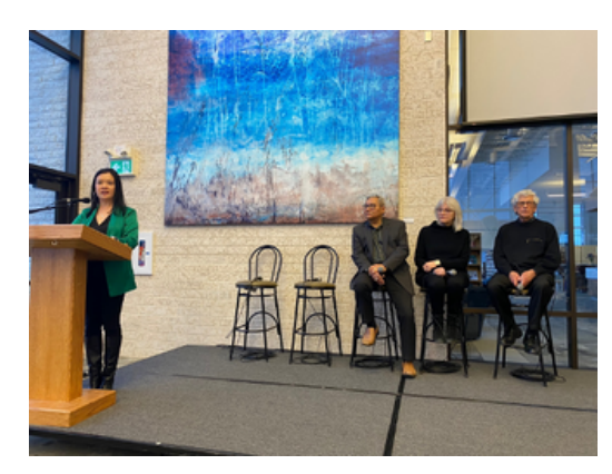
Celebration of MCC's 45th Anniversary of signing first Master Agreement to privately sponsor refugees at Canadian Mennonite University.