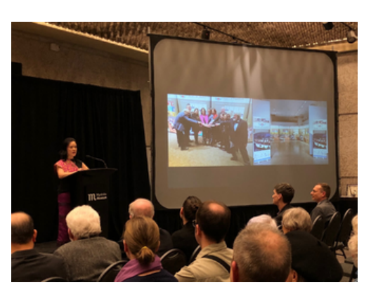
Opening program at Manitoba Museum.