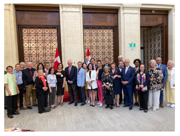
The HOF Team and participants, dignitaries, and Senators