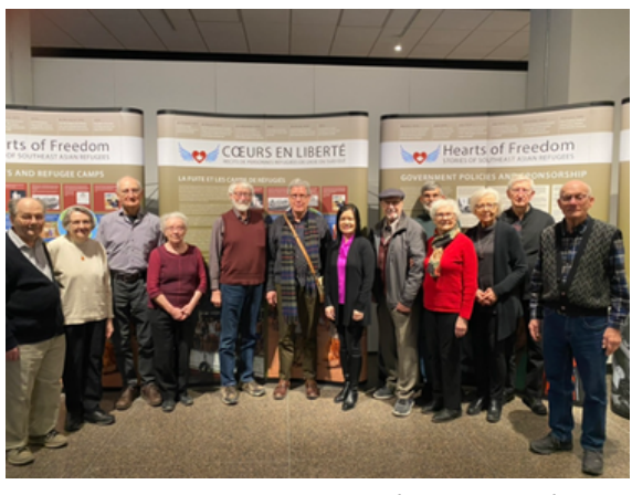
Community group tour at Manitoba Museum.