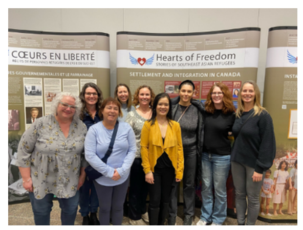
Community group tour at Manitoba Museum.